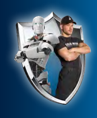
Auto and SAM – the Coverstar team! Protecting your family with the best-built Solid, Mesh and Automatic Safety Covers!